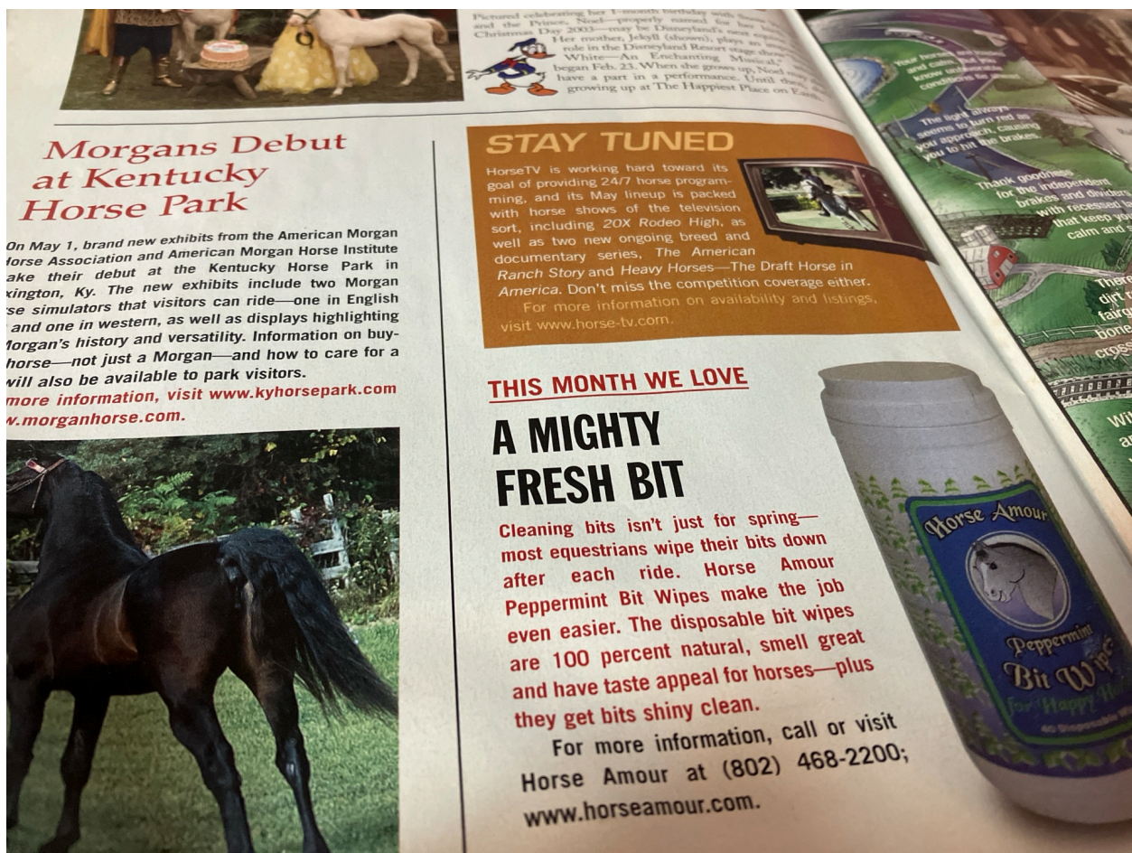
The photo above is from Horse Illustrated, May 2004

or publication I could find. It got great reviews, and quickly began to sell. I had a booth at the Equine Affaire in Springfield, MA in November of 2004 but I had so many people tell me that it was a “stupid product”, “only in America”, “who would ever buy that”, that I didn’t go back to selling face to face. I was contacted by a sales rep who did a great job getting it into tack shops, and a few years later Bit Wipes were picked up by a major distributor, English Riding Supply. The rest is history. I still love to sell directly to my original customers, and I miss knowing exactly where my product is going, but most of my sales are now through my distributor, and they do an amazing job. It’s everywhere now. And all I can handle!