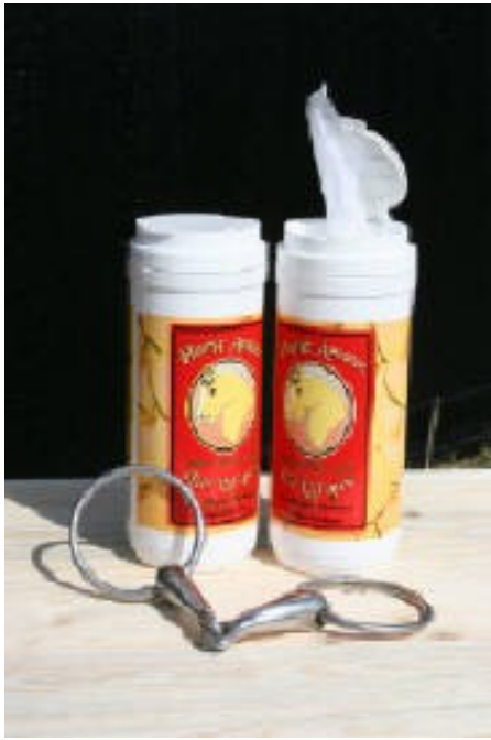
Golden Delicious Apple 2007

digestive benefits. It is a stress reliever and stomach soother, a feel good aromatherapy. With the 2007 addition of Golden Delicious Apple Bit Wipes, there was a flavor alternative for awhile. (Was...pricing on the flavoring increased, then the supplier closed and apple is currently not available, but it is in the works to be reinvented in a red Apple version in 2024)